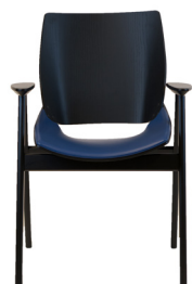
leather / textile seat