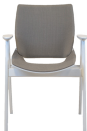
leather / textile seat + back