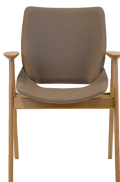
full leather / textile