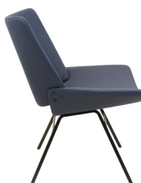
full leather / textile