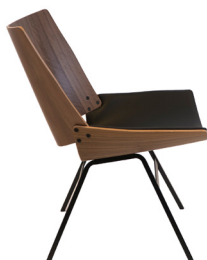
leather / textile seat