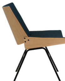
leather / textile seat + back