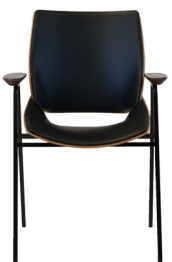
leather / textile seat + back