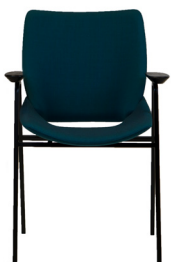
full leather / textile