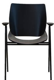
leather / textile seat