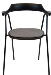
leather / textile mirror upholstery