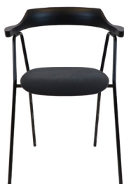
leather / textile seat