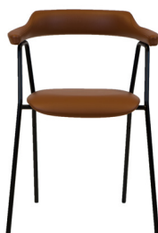
full leather / textile